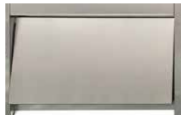
18/8 stainless steel