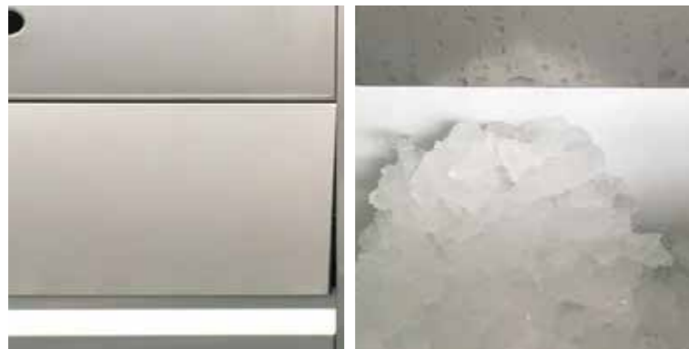
18/8 stainless steel