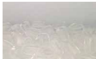
Food grade ABS bin, scratch free