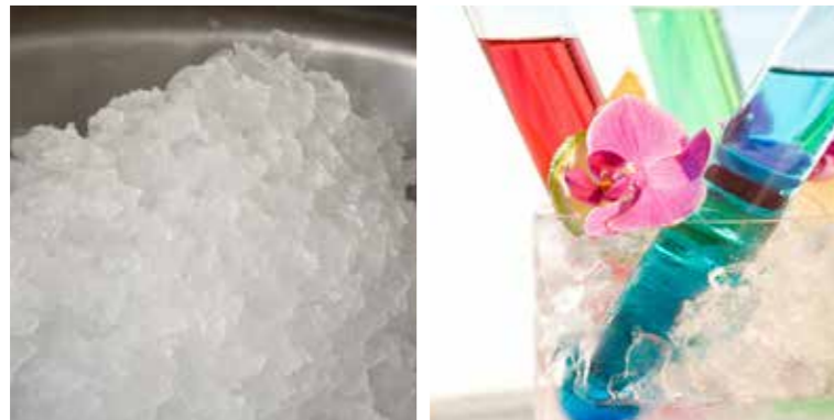
Crispy ice flake