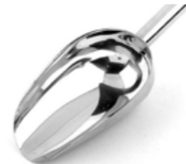
Stainless steel scoop