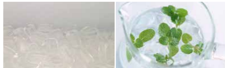
Bullet shape, melt slowly